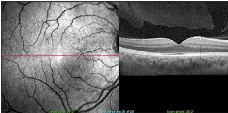
Figure 2. Normal retinal exam with overlying vitreous gel liquefaction and partial separation of posterior hyaloid face nasal to the fovea.

Topcon Medical Systems (Paramus, NJ) recently received approval from the FDA for its 3D OCT-1000 TrueMap Measurement Software, which enables clinicians to visualize the inner limiting membrane, the IS/OS junction, RPE, and Bruch's membrane.